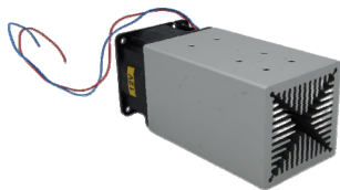
Heatsink incl. fan